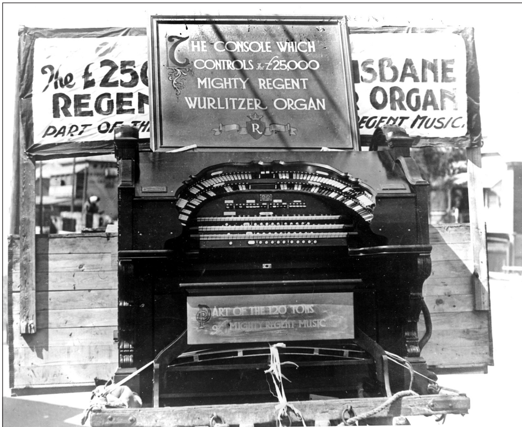
The just-unpacked console at the Brisbane premises of the installers, B.B. Whitehouse Bros.