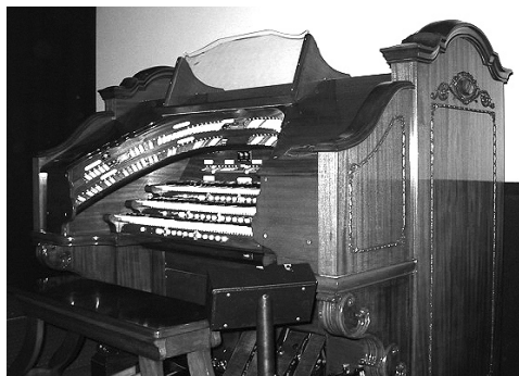
Totally refinished in its original polished rosewood finish, the console is impressive indeed!