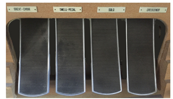
Swell shoes, or expression pedals, on a console for an organ with three chambers. The rightmost pedal is a Crescendo, which activates additional ranks as it is opened more.

The shutters in theaters are often located behind decorative screens that allow the sound to escape, but visually obscure the utilitarian appearance of the shutters in work. Even when the shutters are completely closed, a surprising amount of sound manages to escape.