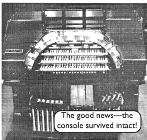
The good news—the console survived intact!