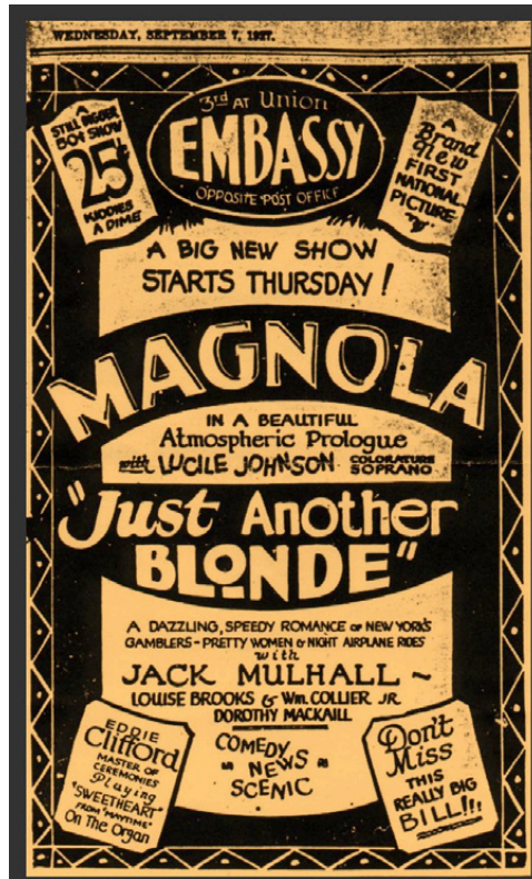
Wednesday, September 7, 1927 movie ad

In this typical American picture there are no special sets, staged thrills, no forced realism—just natural humor and poignant pathos. If you need a laugh tonic you will enjoy seeing "The Show Off" and the new Embassy Theatre.