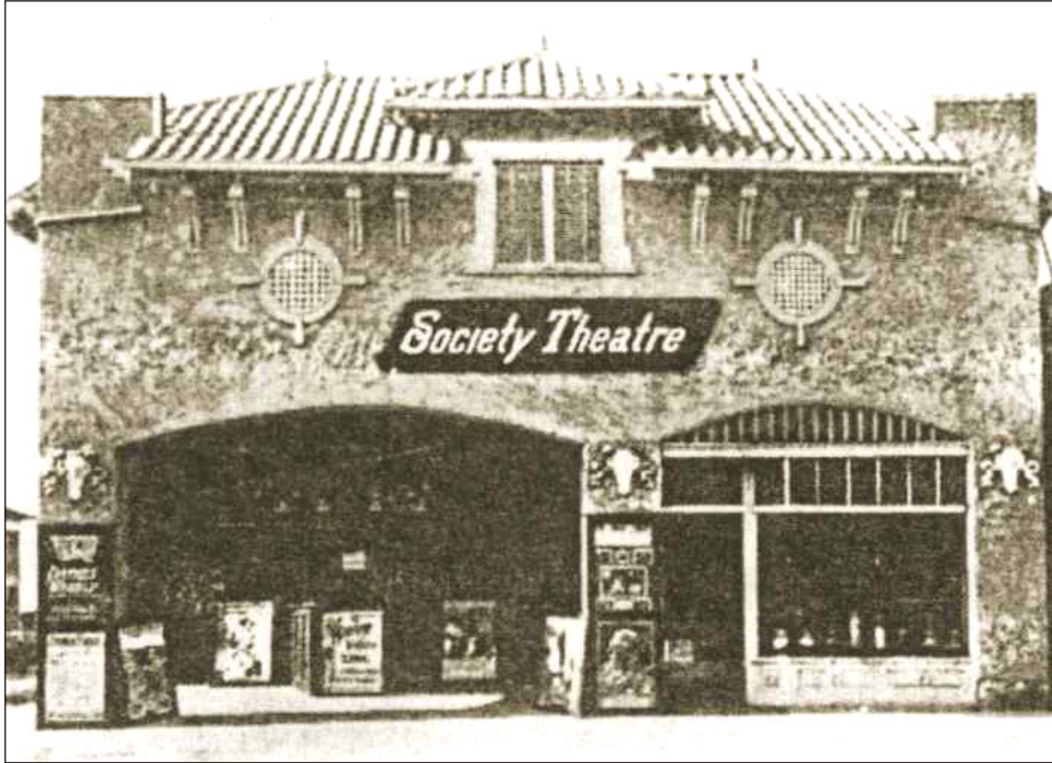
Society Theatre, c.1913. According to the Junchen opus lists, the Society Theatre originally had a 2/7 tubular pneumatic Kimball organ, installed in 1909. In 1921, it was renamed the Broadway Theatre.