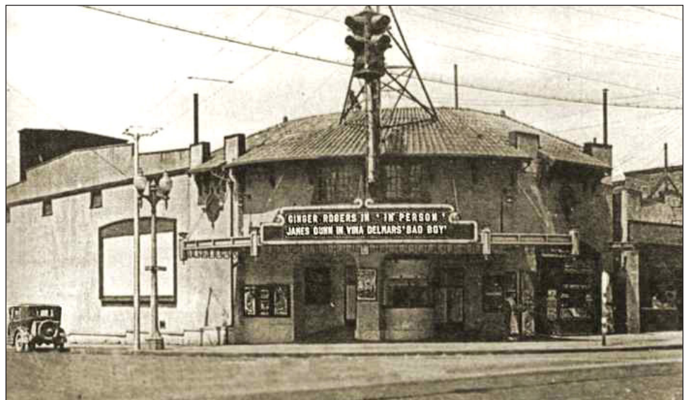
The Broadway Movie Theatre at Broadway and John replaced the earlier Society Theatre. The site is occupied by a Rite Aid Drug Store today.