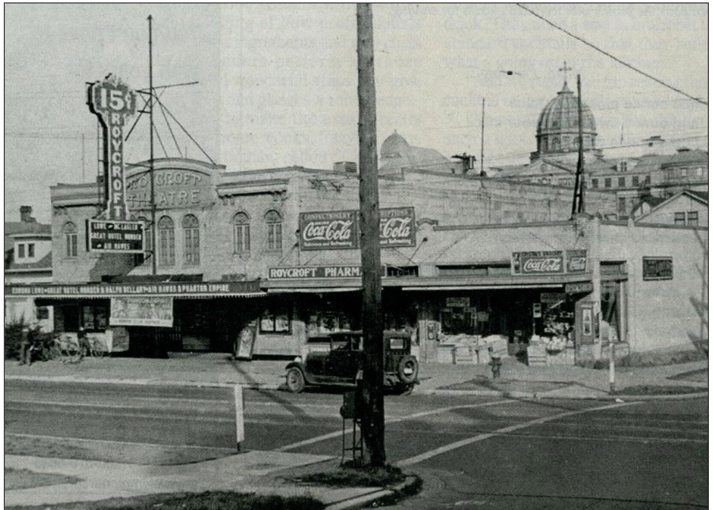
The Roycroft Theatre originally had a 2/5 Robert Morton organ installed in 1925. Feature films, a weekly serial, and cartoons made the Roycroft Capitol Hill’s favorite theatre.