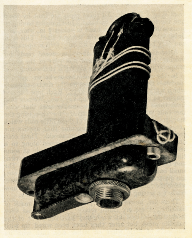
Magnet-coil and Bakelite base

Leaving the wood-working shops, we will pass on to the pipe-making shops. Here we see zinc, lead, and other materials in sheet form ready to be bent into pipes varying in sizes from 6 in. long by \frac{1}{2} in. wide to 16 ft. and anything