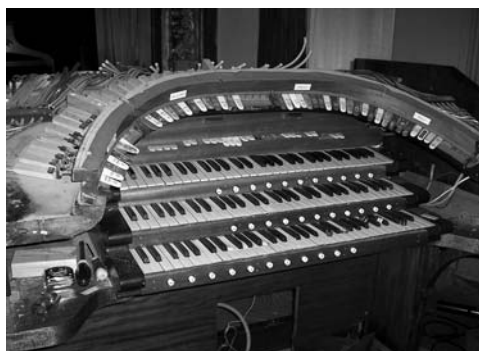
Console of the Centralia Fox Wurlitzer

The Beeks organ is installed in a new under-stage chamber in an area previously occupied by dressing rooms. In addition to the huge task of installing the organ itself, Fred and Eva have done nearly all the preparatory work themselves including creating a large tone opening in the back wall of the orchestra pit, making structural modifications to the new chamber area, cleaning and painting the chamber and pit area, as well as wiring the blower. It has been an enormous task for the two of them requiring many week-long trips from Anacortes spent "camping" in their motor home parked in a nearby Elks Lodge lot.