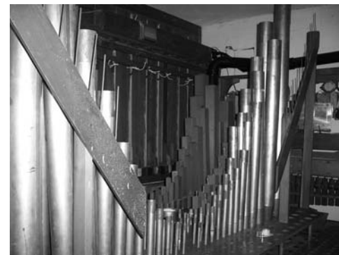
Pipework in the understage chamber