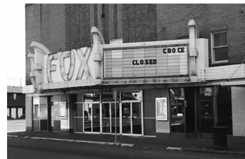
Centralia Fox Theatre marquee