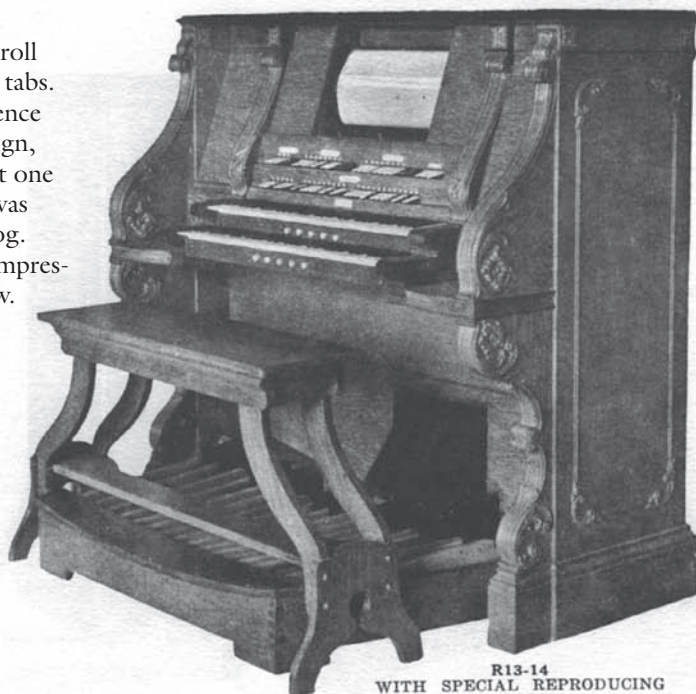
R13-14 WITH SPECIAL REPRODUCING ROLLS (165 Notes)

The instrument has an impressive stop list, detailed below.